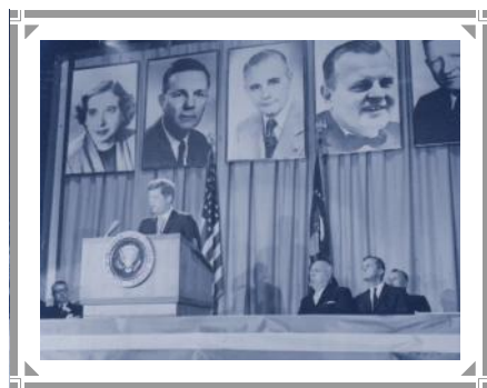
President John F. Kennedy speaks at the Farm Show Bldg, September 20, 1962

It's your history! Together we can preserve it.