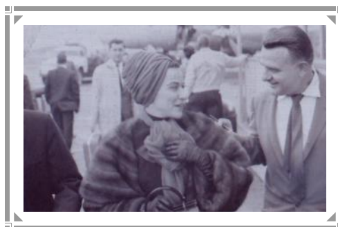
Abigail Van Buren, "Dear Abbey" arrives at Harrisburg Airport March 15, 1957