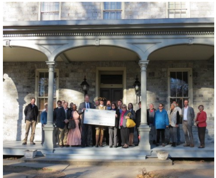
A happy group of HSDC Board members, staff and dignitaries on the newly restored mansion front porch on November 20th