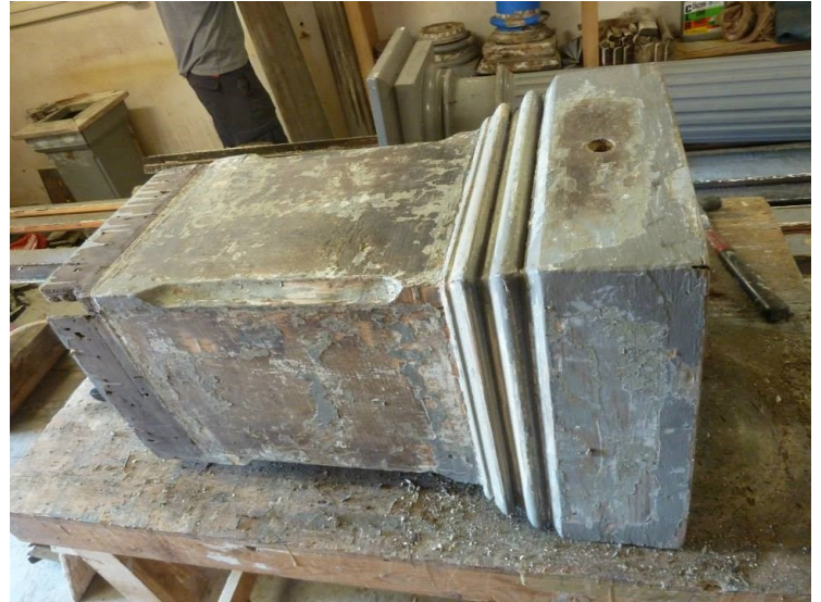
Column base while under repair at Historic Restorations of Lancaster.