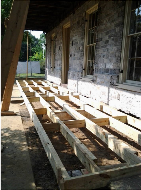
Mansion front while the porch components were at the restoration shop.